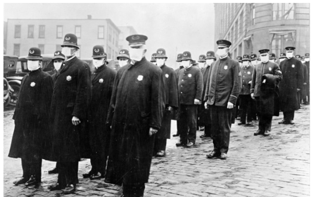
Seattle policemen wearing protective gauze face masks during the influenza pandemic, 1918.

According to the U.S. Department of Health and Human Services’ Center for Disease Control and Prevention (CDC), the devastation of the Spanish Flu occurred in three waves. The first wave began in March 1918, lasting until around May 1918. The second wave was the most impactful, infecting the highest number of people from September to November 1918. Finally, the third wave lasted through Winter and Spring of 1919, dwindling down in the summer of 1919. The current coronavirus may be on a similar course as the Spanish Flu of 1918-1919, as we may now be entering a second wave.